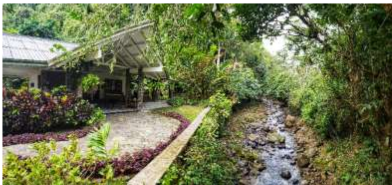
Birding Paradise at the Canopy Lodge

The Canopy Lodge's spacious guestrooms offer comfortable beds and private baths with tasteful interior decoration. The grounds meanwhile, are a birder's paradise. The gardens and walkways are often loaded with birds. In fact, it is not uncommon to record 60 species from the property alone in a single visit. Further enhancing the delightful setting are feeding trays, which draw birds all day long. This is indeed a most relaxing way to bird.