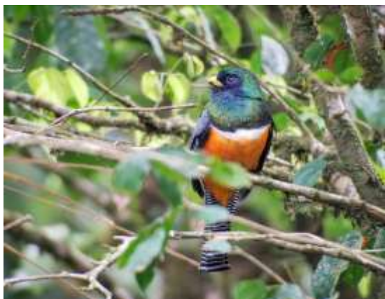
Orange-bellied Trogon

This area is home to some fantastic foothill birds not found in the forests below or the Canal area. Among these, tanagers are the dominant group with potential for gems like Emerald (scarce), Bay-headed, Silver-throated, Golden-hooded, and Tawny-crested tanagers; Tawny-capped Euphonia; and Scarlet-thighed Dacnis.