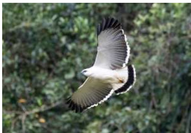
White Hawk

this location are the stunning Black-crowned Antpitta and the incomparable Snowcap. The antpitta is secretive and generally difficult to see, but we have a chance of finding one of these spectacular ground dwellers. Numbers of the tiny, wine-colored Snowcap may vary seasonally, but we have had some success at finding this jewel on recent trips. Additionally, Altos del Maria can be a good area to find a variety of raptors. Double-toothed Kite, the amazing White Hawk, Barred Hawk (very uncommon to rare), Black Hawk-Eagle and Bat Falcon are among the possibilities. At any rate, our visits to Altos del Maria will certainly prove memorable.